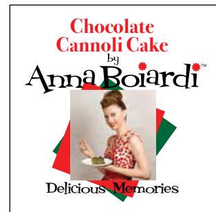
Chocolate Cannoli Cake

Many other products besides dessert items will be included in this line – especially Italian favorites like pizza, risotto, pasta, etc.!