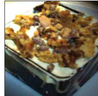
Chocolate Chip Cookie Tiramisu